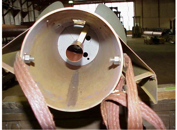
Figure 4: Pressure Protected Antenna After 30 Years of Service in Chicago

pressure changes. After 30 years of service, critical components (Figure 4) will still be shiny and undamaged.